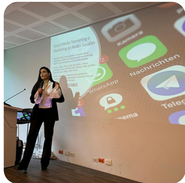
DIGITAL MARKETING STRATEGIST