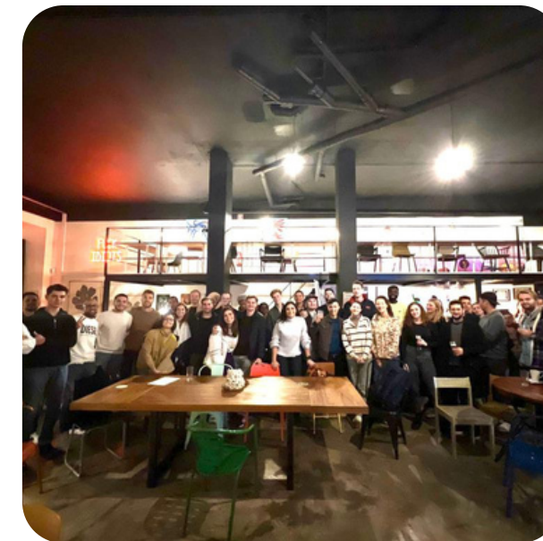
CREATE AND LEAD BUSINESS COMMUNITIES