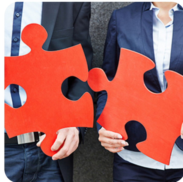
CONNECTING B2B AND B2C